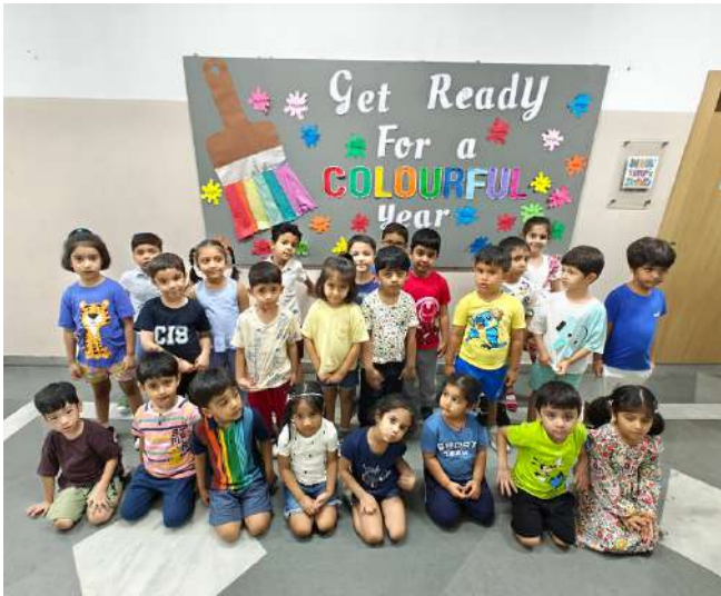
Getting ready for a colourful year ahead

We welcome the learners of Grade Nursery B as they embark upon this amazing new journey of discovery and growth.