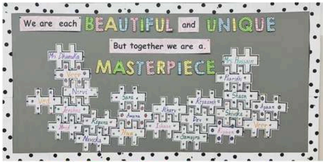
Upper Nursery A