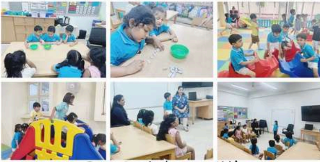
Upper Nursery B