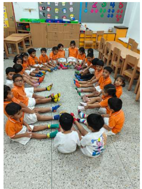
Colourful socks day