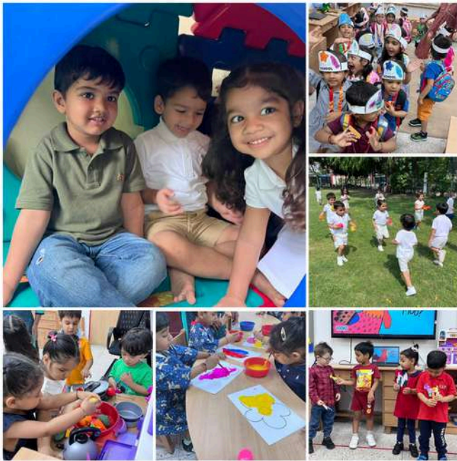
Pre Nursery A

We are thrilled to extend a warm welcome to the newest members of CIS, joining Grade Pre Nursery for the new academic session 2024-25. We look forward to the fun and learning ahead as they begin this new journey. Wishing them the best of luck!