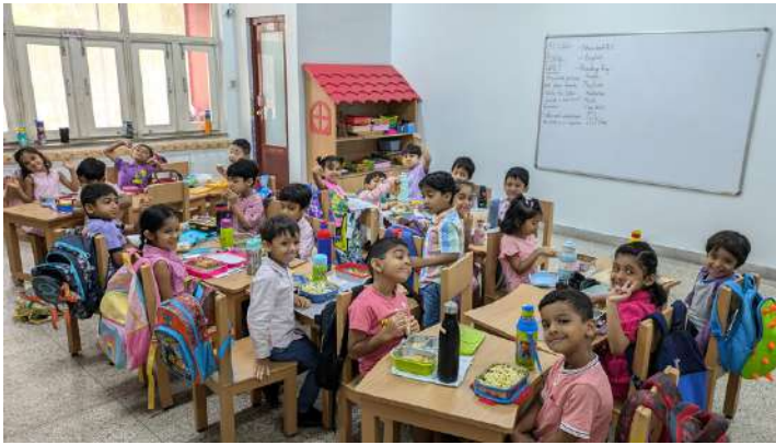
Celebrating Pink and Purple Day

We welcome the learners of Grade Nursery A as they embark upon this amazing new journey of discovery and growth.