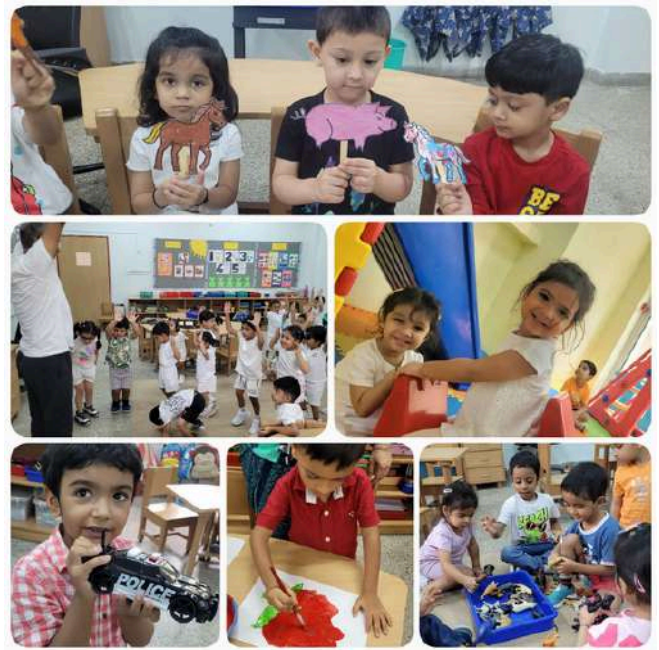
Pre Nursery B