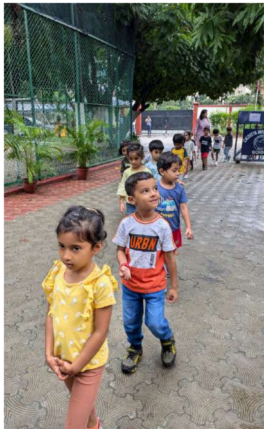
On a liListening Walk