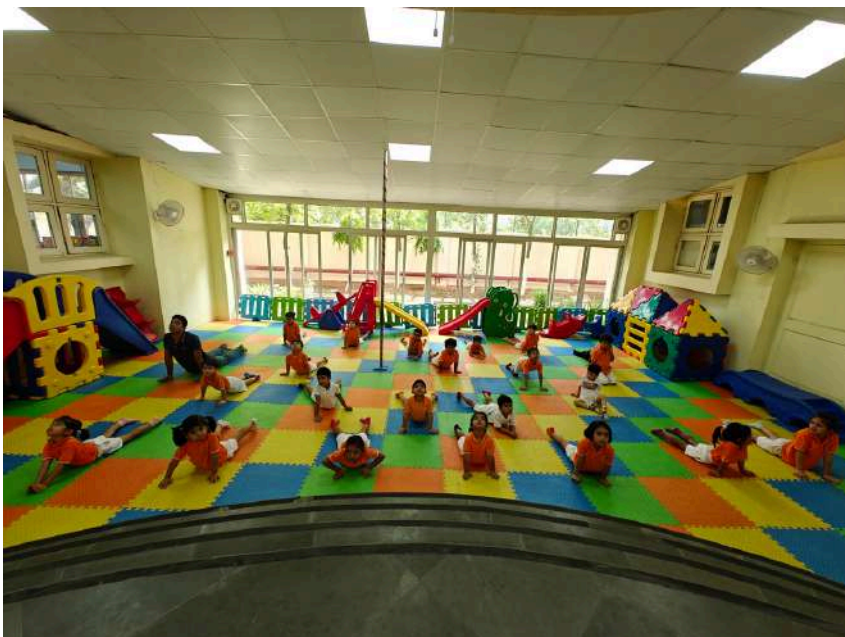
Asanas to keep us fit