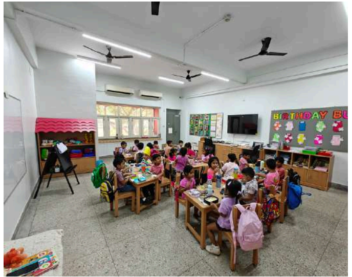
Our classroom makes us happy!