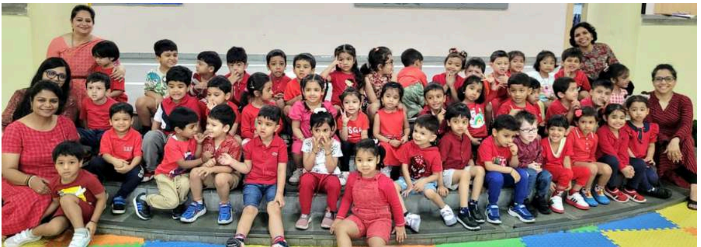
Group Photo - Pre Nursery A and B