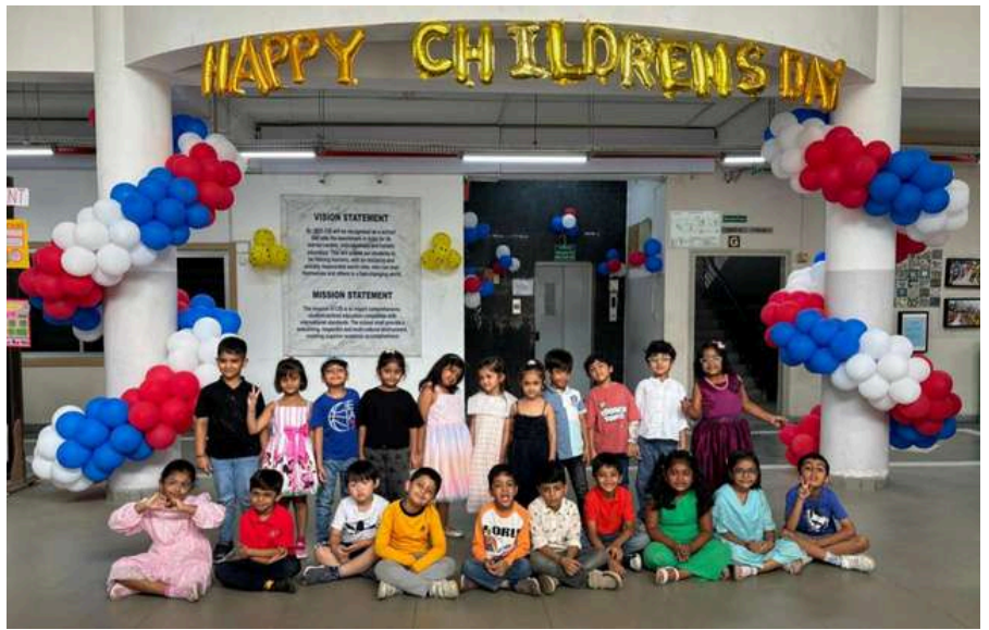
Amidst cheerful balloons and happy faces, the students of Grade Upper Nursery A celebrated Children's Day with a fun game of passing the ball, fostering joy and team spirit!