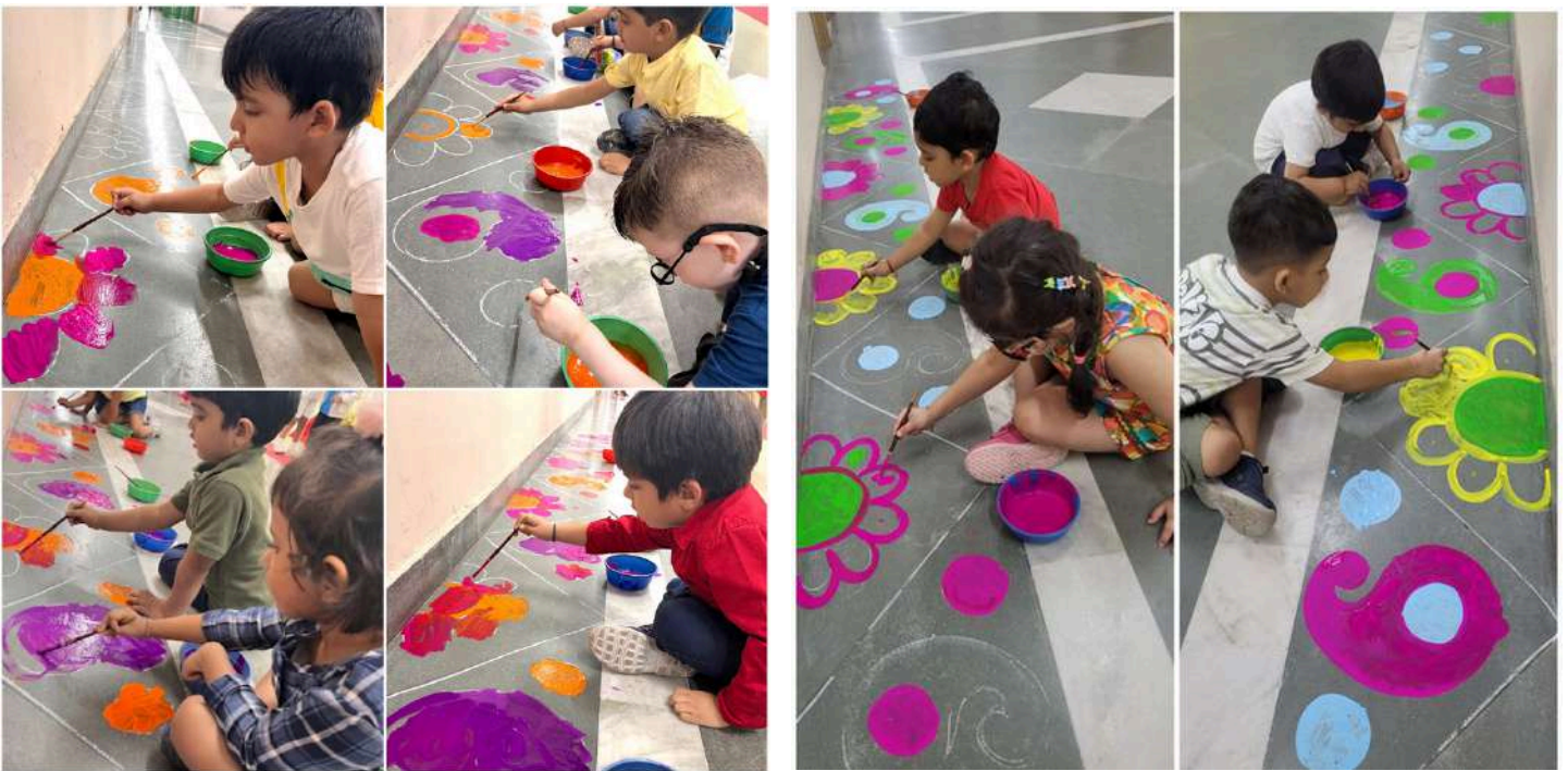
Students of Grade Pre-Nursery making Rangolis for Diwali.