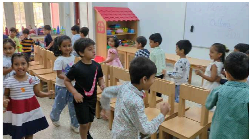
Grade Nursery A's Children's Day celebration was a joyous blend of laughter, fun, and cherished moments as the little ones enjoyed a lively game of musical chairs with their friends.