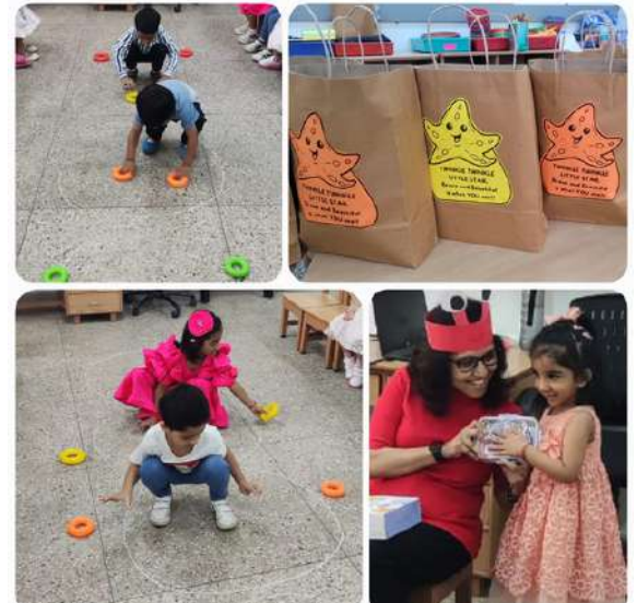
Grade Pre-Nursery B enjoyed a fun-filled "Let's Arrange" game, followed by a joyful gift distribution!