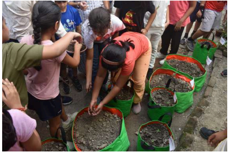
Grade 2, sowing and planting sapling.

This initiative focused on the kitchen garden at the school's backyard, where Grade 2 students enthusiastically planted saplings of brinjal, cucumber, coriander, tomato, broccoli, ladyfinger, beans, and green chillies.