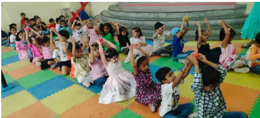
Grade Upper Nursery B celebrated Children's Day with joy and laughter, enjoying fun games and bonding with their peers!