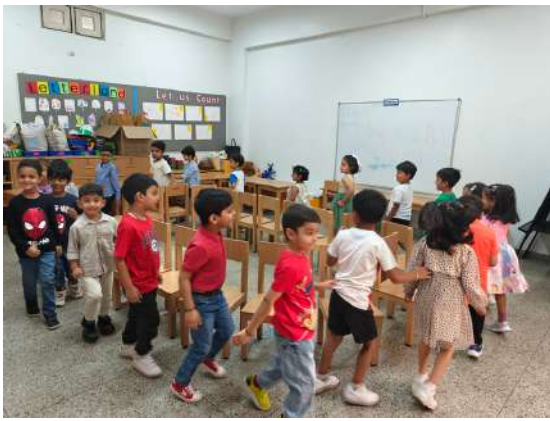
Grade Nursery B's Children's Day celebration was filled with smiles, laughter, and unforgettable memories as students enjoyed a lively game of musical chairs with their friends.