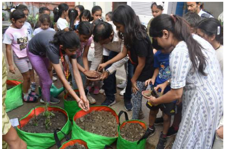
Grade 5, adding vermicompost.