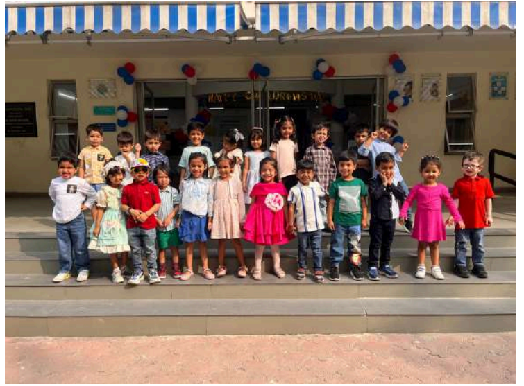
Grade Pre-Nursery A had a blast playing "The Floor is Lava," wrapping up the fun with big smiles in a delightful group photo!