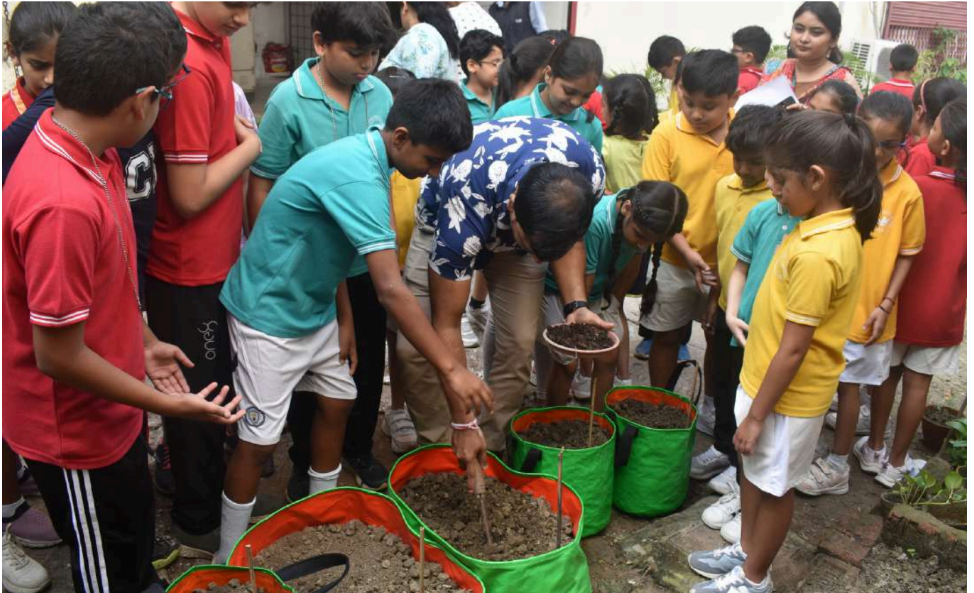
Grades 2 and 5 collaborating to plant saplings in the school backyard.

The popular slogan came to life through an inspiring vertical collaboration between Grades 2 and 5 on the 7th and 8th of November 2024.