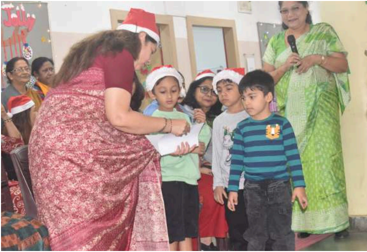
Ho! Ho! Fun time with Santa